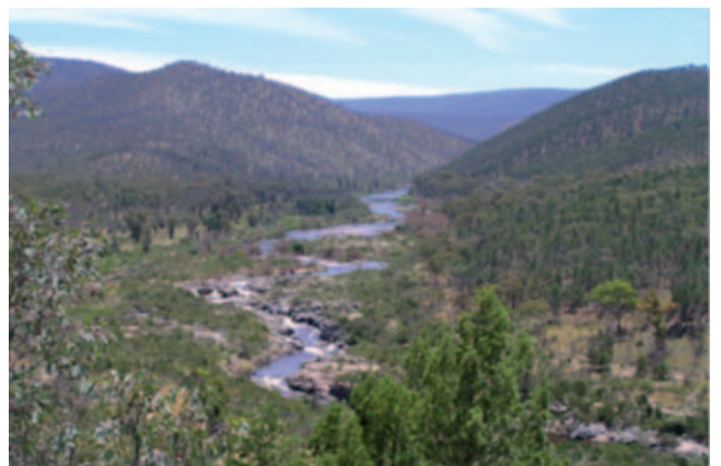
Rainshadow Woodlands and Open Forests