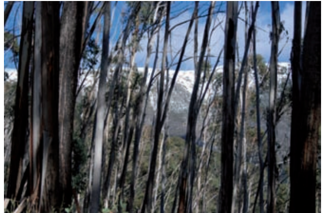
Tall Wet Forests