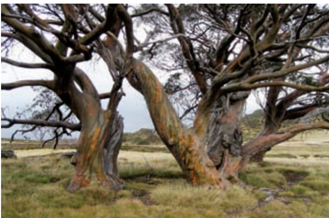
Sub alpine Woodlands and Open forests