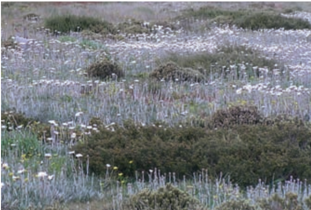
Alpine Grasslands and Herbfields