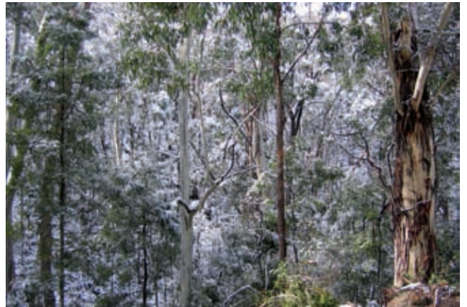
Moist Montane Forest