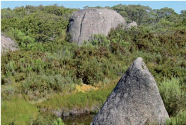
Alpine Bogs and Fens and Alpine Heathlands